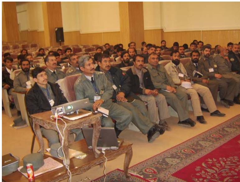
A view of Electronic Payroll System (EPS) workshop for Ministry of Interior (Mol) Finance Officers

Project ID: 00052084 Duration: 2 years Component (MYFF): 2.7 Public Administration Reform and Anti -Corruption Total Budget: USD 155,612,575 Implementing Partners/Responsible parties: Ministry of Interior (Mol)