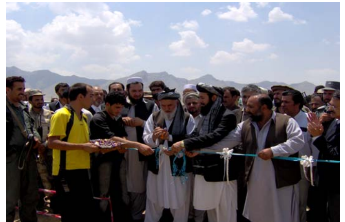
H.E. Minister Ustad Mohammad Akbar and H. E. Governor Haji Din Mohammadd Cutting the Ribbon

Project ID: 00051619 Duration: September 2006 – December 2008 Component (MYFF): Total Budget: 7,271,706.00 Unfunded: N/A Implementing Partners/Responsible parties: UNDP, MORR, MOUD