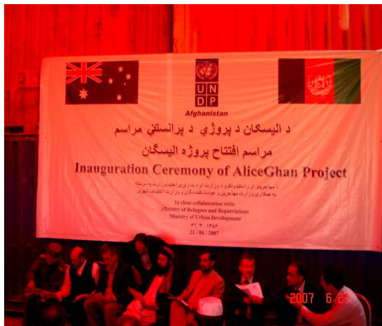
Participants during the Inauguration Function