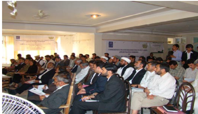
Workshop on Herat PDMP draft presentation 27 th Aug 2008, Herat Province

Project ID: 00052355 Duration: January 2007 to December 2011 Component (MYFF): Service Line 3.1, Frameworks and Strategies for sustainable development Total Budget: USD 9,811,515 Unfunded: USD 8,082,888 Implementing Partners/Responsible parties: UNDP & ANDMA