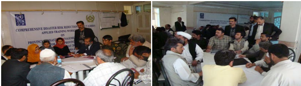
Herat Provincial Disaster Management plan formulation workshop on 27 August

The Provincial Disaster Management Planning has been initiated in Herat province, followed by a three-day training workshop in April. The draft plan is completed and is translated to English. Three days workshop on finalization of the provincial disaster management plan for Herat province was conducted from 27 to 30 th August 2008 where comments have been collected and incorporated. The final plan was submitted to ANDMA for review and comments.