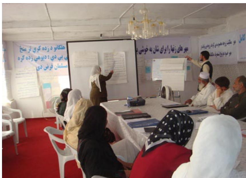
Workshop for community leaders on topic of family and personal status law in Jawzjan, September 2008.

Project ID: AFG/00047012 Duration: 1st November 2005 – 31 December 2008 Component (MYFF): MYFF Goal 2.4 – Justice and Human Rights Total Budget: Euro 6,000,000 (USD 7,200,000) Implementing Partners/Responsible parties: UNDP and NGOs