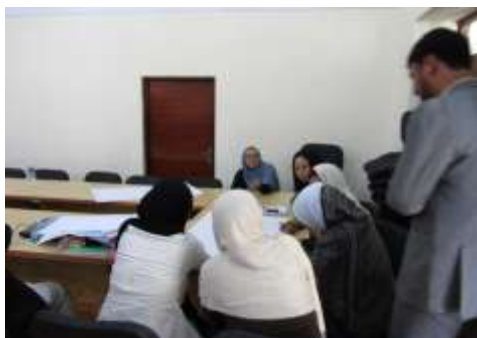
Women from the Provincial Council, AWN, and Provincial Police work on a justice needs assessment for Bamiyan Province.

In Bamiyan, the workshop was led by the head of the Provincial Legal Aid Association and Bar Association, and attended by 65 (53 male, 12 female) leaders in Bamiyan's justice sector, including the heads of the Provincial Prosecutor's Office, shura-e-ulema , and