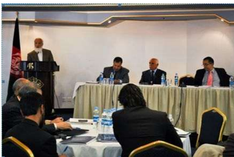
Afghanistan Minister of Justice H.E. Habibullah Ghalib addresses the Public Legal Awareness / Legal Aid National Conference, 31 May 2011