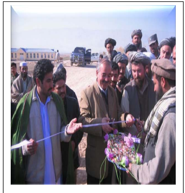
[Labour Based Development Programme, Baghlan]