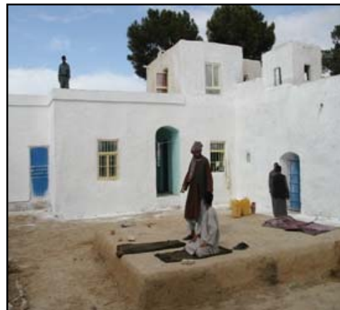
Khulum District, Herat Province, detention centre after rehabilitation

Project ID: AFG/00071252 Duration: 26 June 2009 – 30 June 2012 Strategic Plan Component: Focus Area 2: Democratic Governance CPAP Component: Outcome 3: Access to Justice and Human Rights ANDS Component: Pillar 2: Governance, Rule of Law and Human Rights Total Budget: USD 36,958,430 Responsible Agency: UNDP