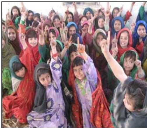
Legal rights education in the primary and secondary schools in Nangarhar Province