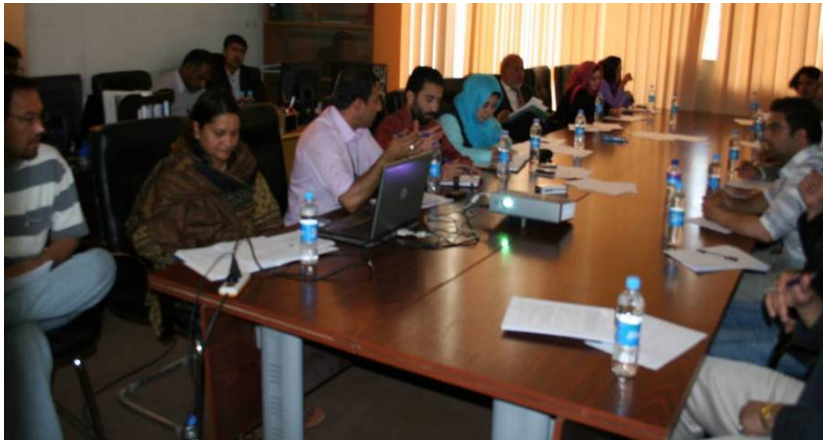
Workshop on Legislative Drafting for Committee Assistants of Wolesi Jirga 2009

Project ID: 00059607 Duration: March 2008 – February 2012 Strategic Plan Component: Democratic Governance CPAP Component: Outcome 4 ANDS Component: GOVERNANCE, RULE OF LAW & HUMAN RIGHTS Total Budget: 15.3 USD Million Responsible Agency: UNDP