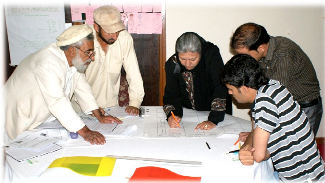
Training participants on CBDRM from ANDMA, Kabul University, MRRD and NGOs during training group work